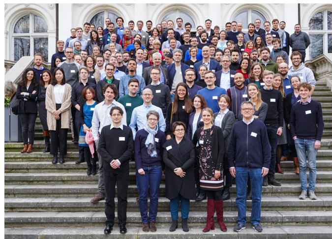
BIH Charité Clinician Scientist Retreat 2020

All Calls are advertised and can be applied for via: www.bihealth.org